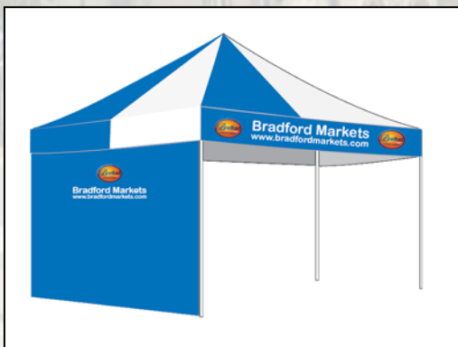
Artists impression of our 3m x 3m units

Additionally, a proposed £8m Shopping Centre development in Bingley town centre will add to the town's shopping repertoire and further benefit the new Bingley Open Market area.